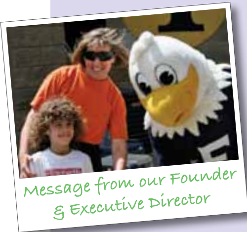
Message from our Founder & Executive Director

For 28 years, Lekotek of Georgia has been making a difference for children with disabilities and their families. We began in the basement of Easter Seals; today we operate six sites. During our first year, 52 families participated in play sessions. This year nearly 500 families benefited. Our initial budget was $40,000; today it exceeds $500,000.